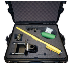
Rugged Shipping Case