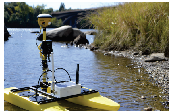
Unit can be integrated into remote / autonomous survey vessels

Seafloor Systems, Incorporated | 4475 Golden Foothill Parkway | El Dorado Hills, CA 95682 | USA