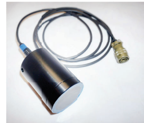
Single Frequency Echosounder Units