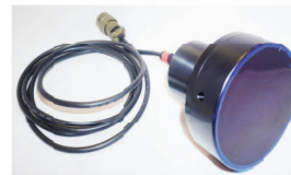
Dual Frequency Echosounder Units