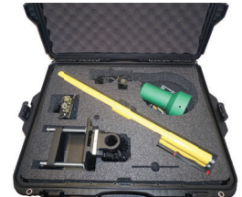
Rugged Shipping Case